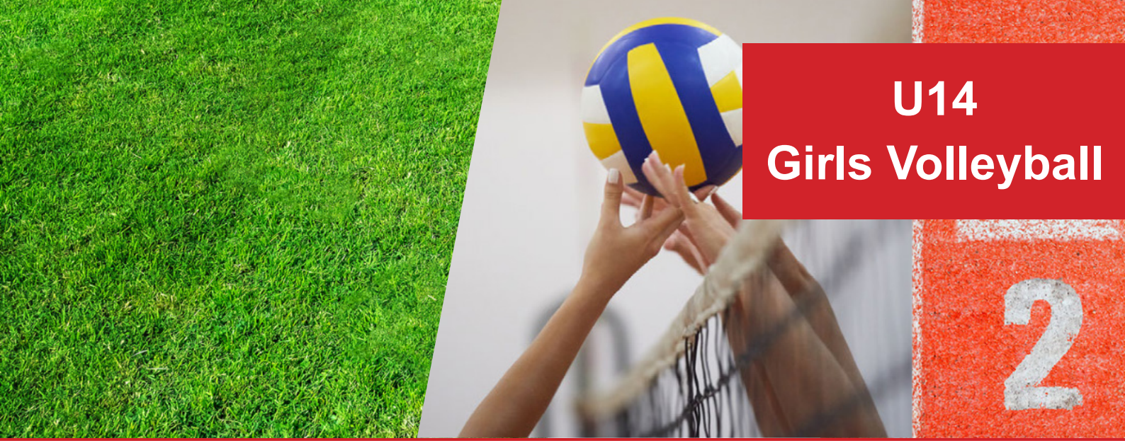
April 13th- Friendly Match at Bavarian International School

On April 13th we embarked on a thrilling journey to FIS (Franconian International School). This was our very first time playing as a team, with only two practices, and two of our best players missing. Our first game was against FIS. We consider FIS to be one of the best (or the best) volleyball team in the GISST tournament. We were thrown into the deep end and had to learn our team mechanics as we went. It was certainly an experience. No big surprise we were swept off our feet, and FIS secured a large victory against us in the first set. The second set we started to play better and got our mojo. Unfortunately we lost, but there was a definite improvement in the way we were playing. We even got a few bumps, sets, and spikes over the net! We lost the match against FIS with our heads held high, knowing we had a good chance to win against other schools, because we now had team chemistry.