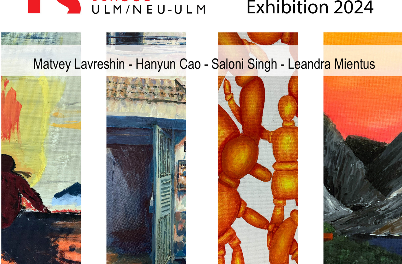
Donaustr.5, 89073 Ulm Opening 8 March 18:00 - 20:00 Public Vieweing 9 March 11:00 - 15:00 Schaufenster 10 - 22 March